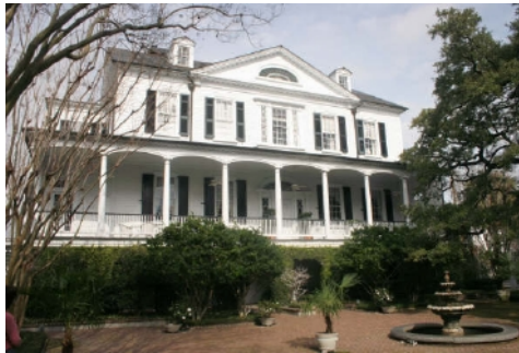
The Governor Thomas Bennett House, site of 2006 LHC Banquet.

Lutheran Identity and Regional Distinctiveness is the theme of the 23 rd biennial meeting of the Lutheran Historical Conference in Columbia, S.C. on October 12-14, 2006. The conference, meeting on the campus of Lutheran Theological Southern Seminary, will feature fourteen academic papers and a panel discussion beginning Thursday at 11:00 a.m. with registration and concluding Saturday at 12:30 p.m. Participants will have the opportunity to join with the entire Southern Seminary community for worship in Christ Chapel on Thursday evening.