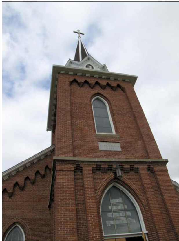
Vasa Lutheran Church, Welch, Minn., a stop on the 2010 LHC bus tour.